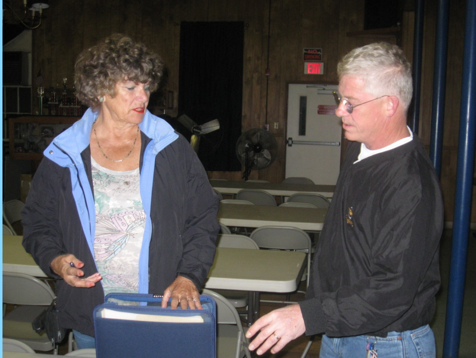
The election committee finalizing their details to present to the flotilla.