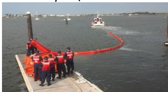
Deploying containment boom- http://bit.ly/Q4WnVA

“The FSO-MT is open to suggestions for member training topics for 2013.”