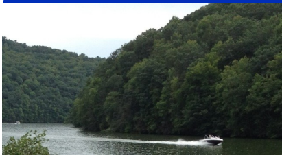
Cruizin' on Lake Zoar—Wonder if they Passed a VE?