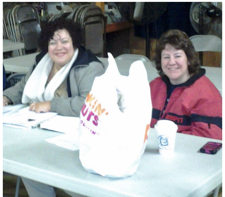
Well I think it is obvious why they are happy

For Information about the COW/ Christmas Party— See page 3