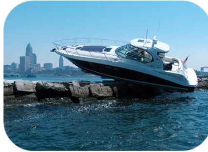
Yep I'd say this guy was off course too

http://www.mandelkerlaw.com/boating-accidents/