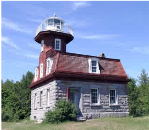
Bluff Point Lighthouse, Valcour Island

The information contained in this document is subject to the provisions of the Federal Privacy Act of 1974 and may be used only for Official Business of the Coast Guard and the Coast Guard Auxiliary.