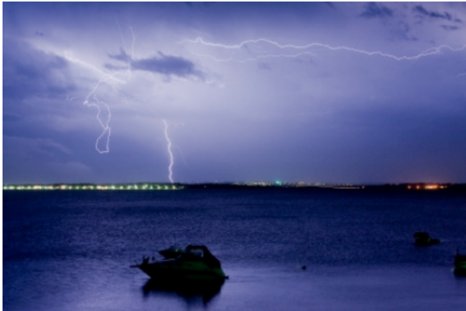
Lightning strikes on the water.

Chief of Staff, First District, Southern Region (D1SR) United States Coast Guard Auxiliary