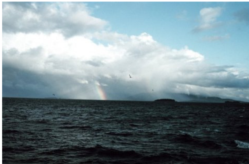
Rainbow after a squall.

Boating season is arriving soon across the country. But is Mother Nature done challenging us?