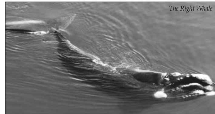
The Right Whale

BTW, if you are interested in being part of USCG Forces, email me at JoinUSCGAux@aol.com or go direct to the D1SR Human Resources department, who are in charge of new members matters, at DSO-HR and we will help you "get in this thing..."