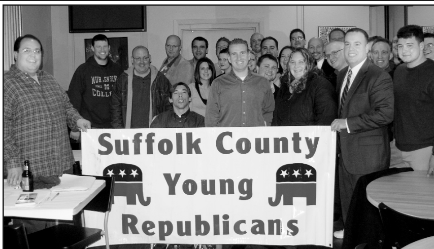
Suffolk County Young Republicans

Newly formed young Republican group imPACT GOP website: www.imPACTGOP.com