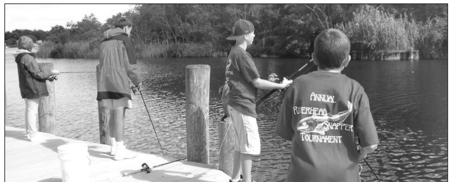
Some of the anglers fishing in last year's Riverhead Snapper Tournament.