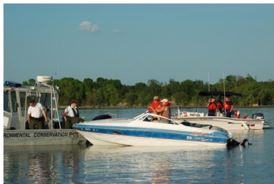
Jim, Charlie and Gary observing and assisting the tow.

Aux Facilities, 181092 (Jim Canavan's boat) and 222095 (Lynn and George's boat) were on patrol for a safety zone for the fireworks. Of course, we all arrived early to take an AOR run and while trying to find a dock/picnic area to eat our subs, a distress call was broadcast from NY State Police asking the CG boats to assist a boat on fire about 3 miles south of the bridge. Charlie Pound maintained radio coms with CG Station Burlington and trainee, Gary Slusher maintained lookout as the five members raced to the scene. The fire was out and a NY Encon boat was also on scene. After discussion about who would tow the disabled, the Encon boat towed with our two facilities flanking them to the Port Henry boat launch.