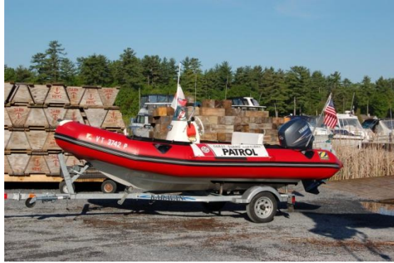
Mike Balch's boat ready to launch for SOTD-S.