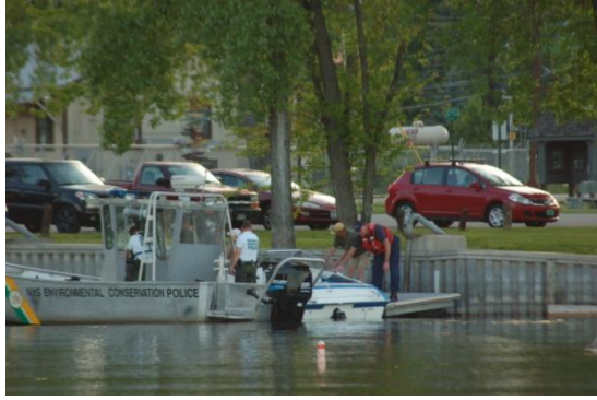
George assisting the disabled vessel at the dock.