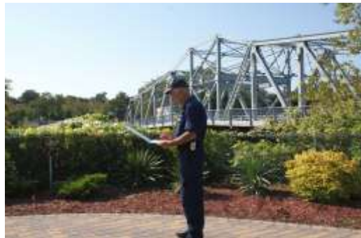
Author inspecting Gregory Ave Bridge over the Passaic River

So the CG checks bridges, both active and inactive, for their impact on waterway commerce. The 1 st CG District, which extends from Canada to Long Branch NJ, has 478 bridges over navigable water which require annual checking. The D1 bridge office only has a few people devoted to bridges. This is where the Auxiliary comes into play.