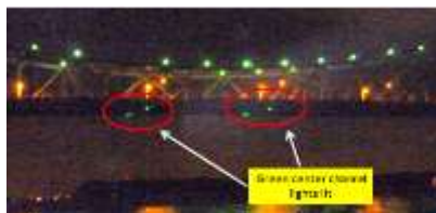
Tappan Zee Bridge showing LNM specified, double-green, center-channel lights Top: lights missing, Bottom: after correction