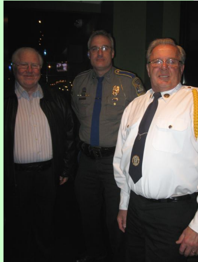
Guests of Honor