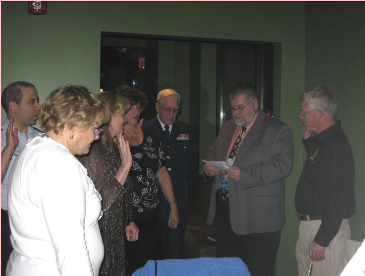
Swearing in of the 2013 Flotilla Staff Officers.