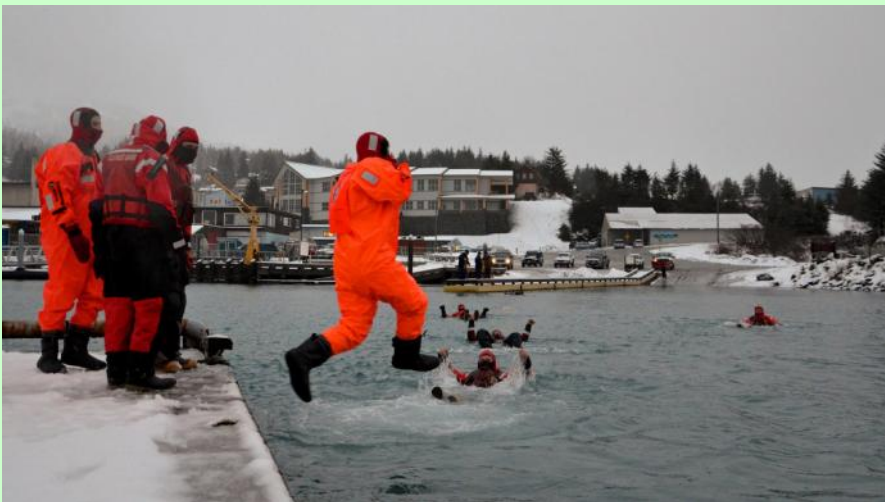
Now that's a morning wake up! Crewmembers from Coast Guard Cutter Sycamore conduct a survival swim in 39-degree water in Cordova, Alaska. The annual training includes practicing survival positions, use of survival equipment & a 100-yard swim.