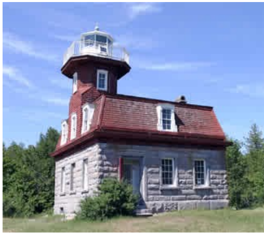
Bluff Point Lighthouse, Valcour Island

The information contained in this document is subject to the provisions of the Federal Privacy Act of 1974 and may be used only for Official Business of the Coast Guard and the Coast Guard Auxiliary.