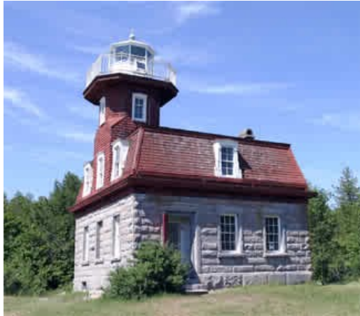
Bluff Point Lighthouse, Valcour Island

The information contained in this document is subject to the provisions of the Federal Privacy Act of 1974 and may be used only for Official Business of the Coast Guard and the Coast Guard Auxiliary.