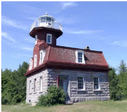
Bluff Point Lighthouse, Valcour Island

The information contained in this document is subject to the provisions of the Federal Privacy Act of 1974 and may be used only for Official Business of the Coast Guard and the Coast Guard Auxiliary.