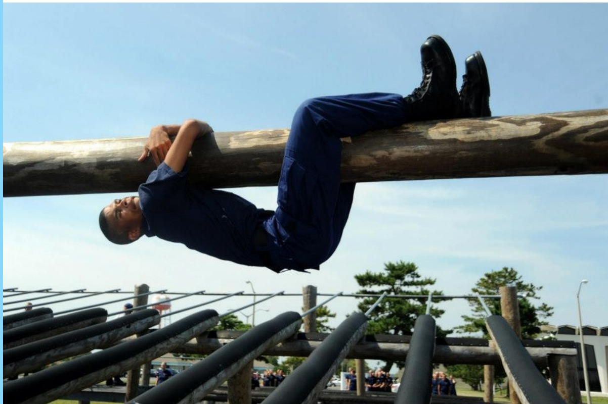
Hang in there!! Only a few more weeks until our next flotilla meeting

A ferry departs from New Bedford bringing mail, groceries, and eager tourists.